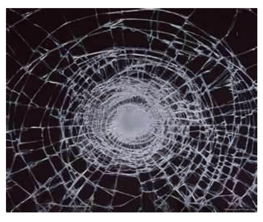
▲ Explosion Proof Glass