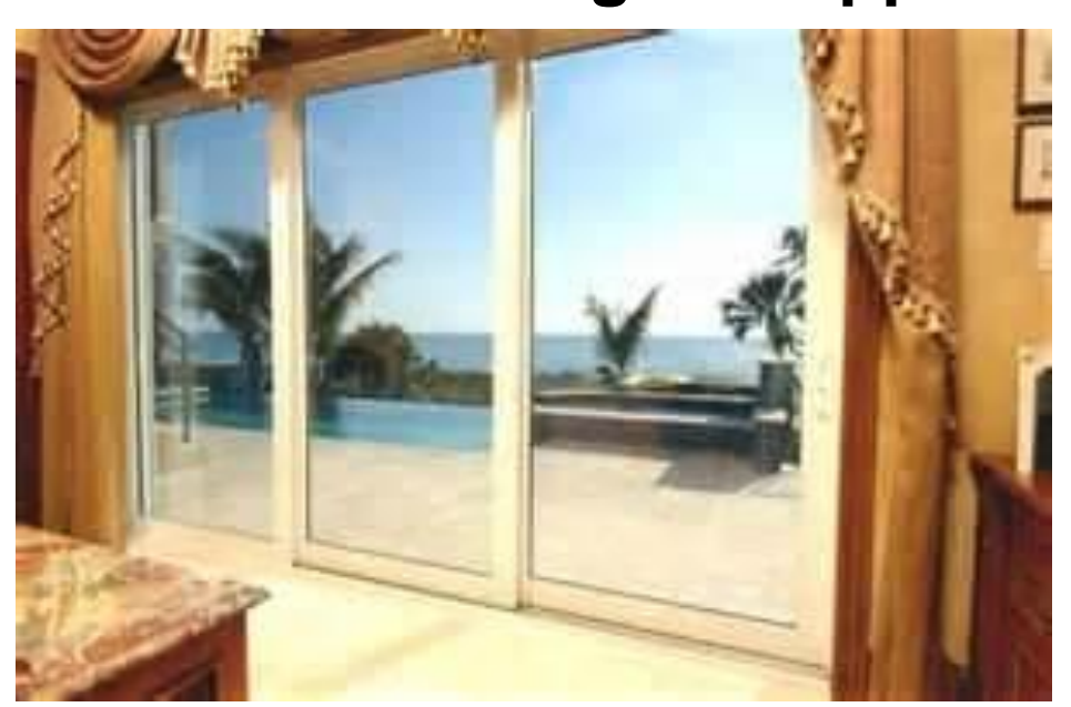
Hurricane resistant Glass