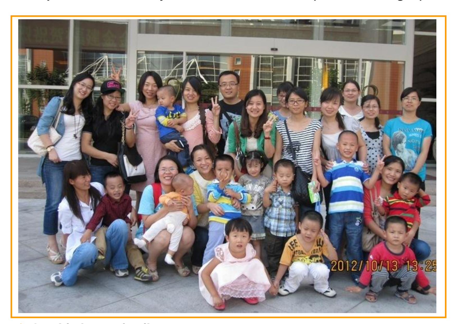
▲ One big happy family

Editor: This is our department. It is a energetic team, from the picture, you can feel it. Our object is 'Help each other, care for each other; Provide best service to customers, enjoy the happiness of life'. Now the second generation of our team is starting to grow up. They are one of our motivations to create a better future!