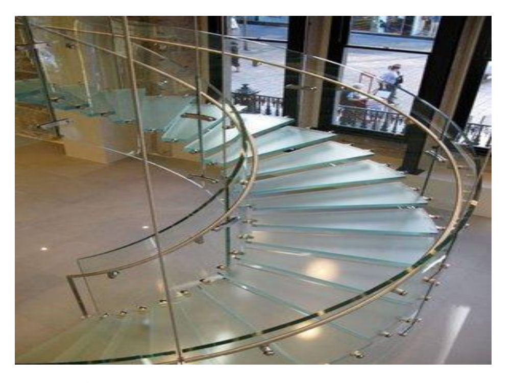
▲ Vitreous Stair